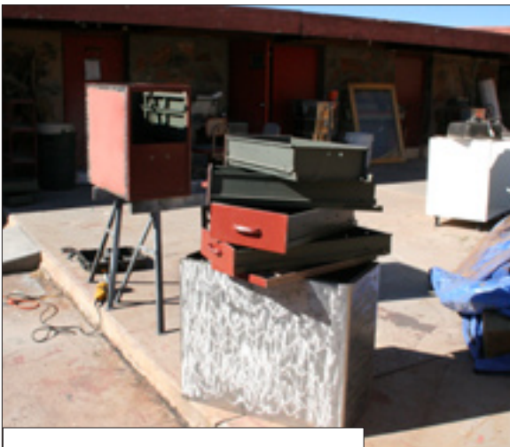
stripping paint off file cabinets

inches thick and the sturdiness is extremely dense. The paint on the filing cabinets has been completely stripped using a grinder then I added a rusted finish. The rusted finish used on the studio suite is a combination of iodine, chlorine, and lemon. Apply the lemon on bare steel and instantly you see a color change later