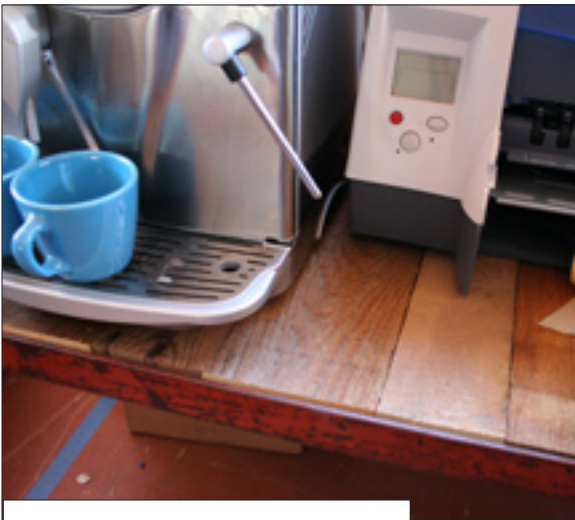
detail - pallet wood shelf

apply a coat of chlorine and fish with a iodine (common salt) scrub. After everything has dried I applied a coat of poly-acrylic to lock in the color and prevent the color from coming off.