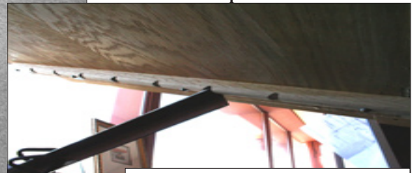
early design - desk

The most prevalent fabrication joinery techniques used is arc welding. The desk top composite is made from sandwiching eight layers of cardboard together with a top and bottom layer being three-sixteenths inch masonite. The total width of the desktop is one and half