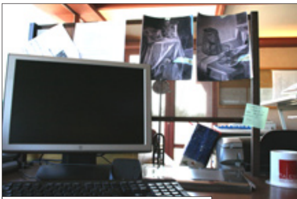
detail - sunn screen

The process starts with a simple study of what I like in proportions. The desk should be slightly higher than a standard desk so it can be used for model making and layout. The drawing table should have multiple position angles to account for my different types of media (more upright for illustra-