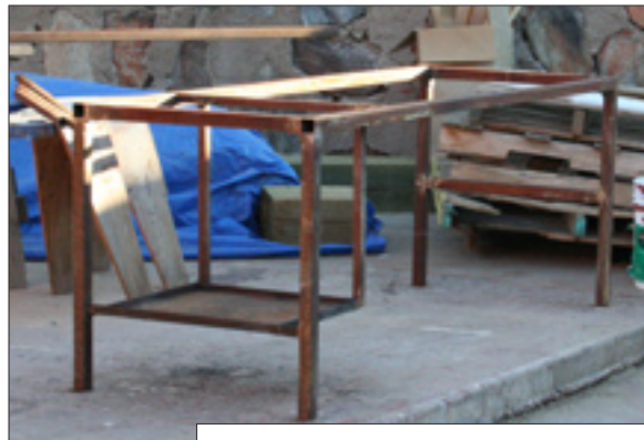
construction - desk frame

The entire process took almost two months (breaks in between each piece) and about thirty man hours. The total cost is under one hundred dollars with the majority of the charges coming from poly-acrylic and the ma-