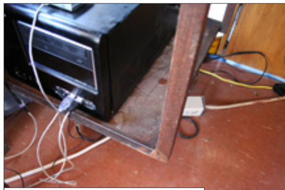
detail - computer stand